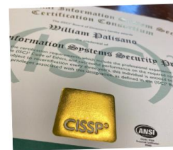
MEET OUR CISSP! PAGE 4