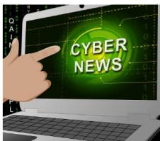
LATEST BILL'S PICKS PAGE 1