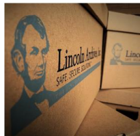
DOCUMENT STORAGE TIPS PAGE 3