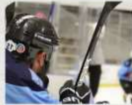
Lincoln Archives' to participate in 11 Day Power Play Page 4

April showers brought May flowers and more to Lincoln Archives & LACyber!