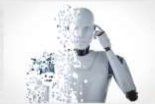
"The AI Act" – The First Law on Artificial Intelligence Page 1

LACyber DATA PROTECTION SERVICES A Division of Lincoln Archives