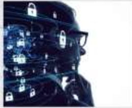
Why Cyber Resilience Matters for SMBs Page 2